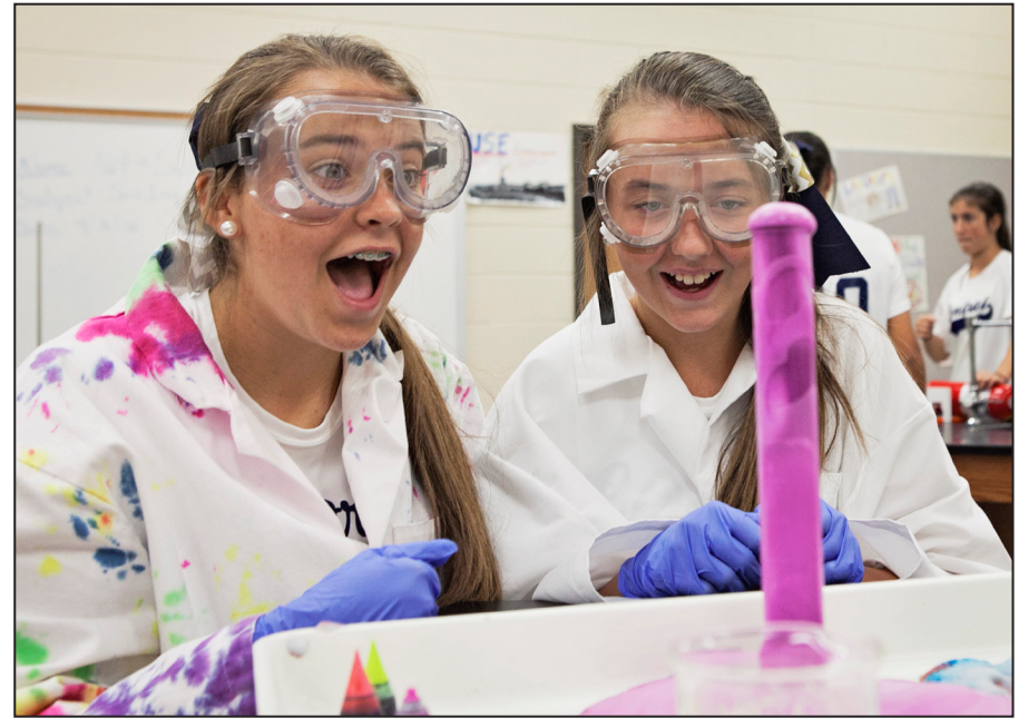
Enrichment and accelerated instruction is available for gifted, talented, and high achieving students beginning in kindergarten.

MERIT, the area's most comprehensive program for gifted and high achieving students, begins in fifth grade.